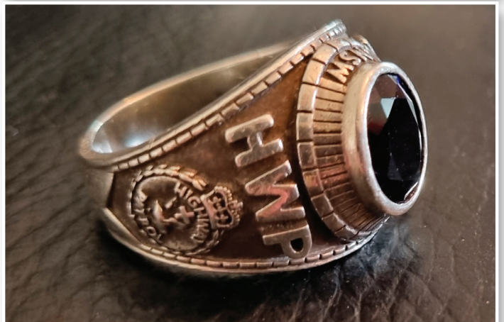
HWP 1975 - Commemorative Ring