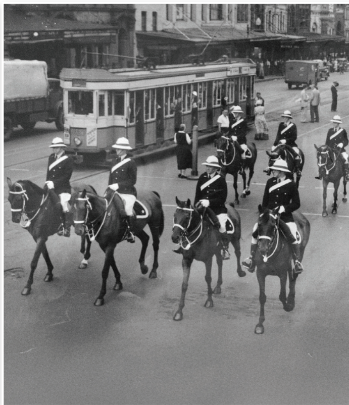
Circa 1940s tram