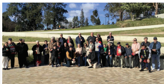
Nepean Belle Group

On Thursday 10th of July we had a great afternoon on the Paddleboat, Nepean Belle cruising the Nepean River. We had clear skies and icy winds to celebrate Xmas in July. 35 intrepid souls enjoyed the day.