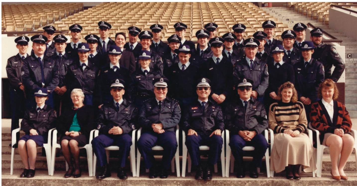
The Glebe Police Staff Photo – 8 Div (not all staff in photo from 1990)