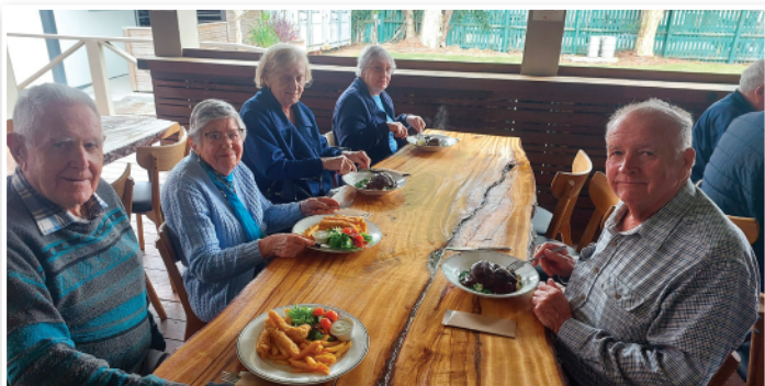
Some of our branch at lunch in Casino

We had our last meeting at Tattersalls Hotel in Casino on the 22 July 2025. This was also our annual general meeting where all positions were declared vacant. Thanks to all those who volunteered for the next 12 months to act in various roles.