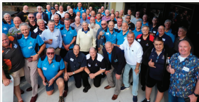
Ex Police cadets at reunion July 2025 on the Gold Coast