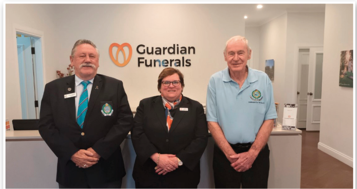
Guardian Funerals Biggest Morning Tea

Several of our members also attended Guardian Funerals Biggest Morning Tea. Guardian Funerals Blacktown have been our sponsors from the since our branch commenced some 12 years ago. A great morning tea was presented but no raffle prizes this year for our members.