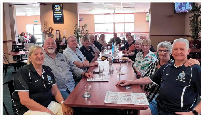
Group at Jinderra