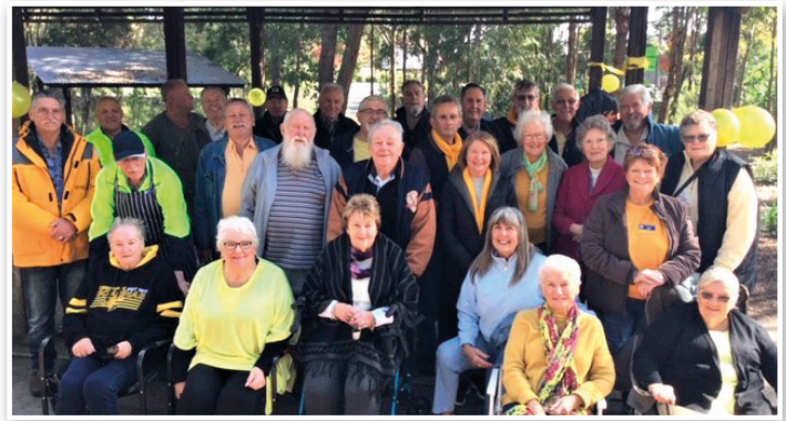
Fundraising BBQ for Cancer Council

Several of our members also attended Guardian Funerals Biggest Morning Tea. Guardian Funerals Blacktown have been our sponsors from the since our branch commenced some 12 years ago. A great morning tea was presented but no raffle prizes this year for our members.