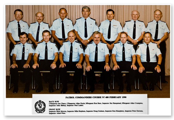
Patrol Commander's Course 1990