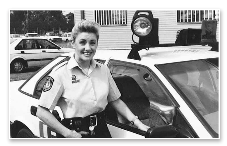
Anyone know her name