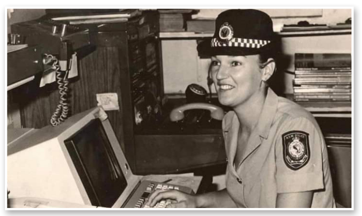
Computerisation - and the Operator is? .........