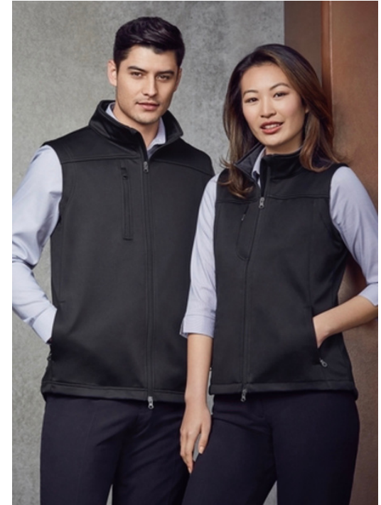
Mens & Ladies Soft Shell Vest