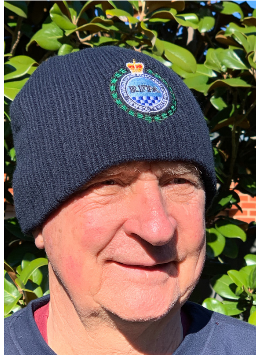
Cap or Beanie $20