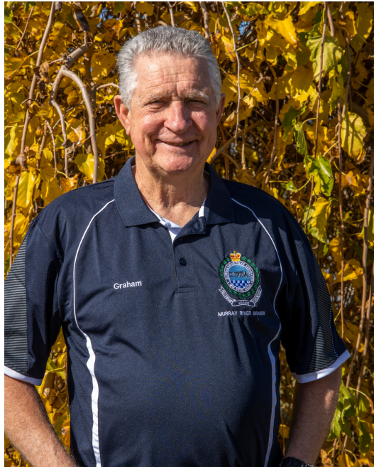
Mens & Ladies Razor Polo's (P405L & P405M) 100% Polyester $30.95