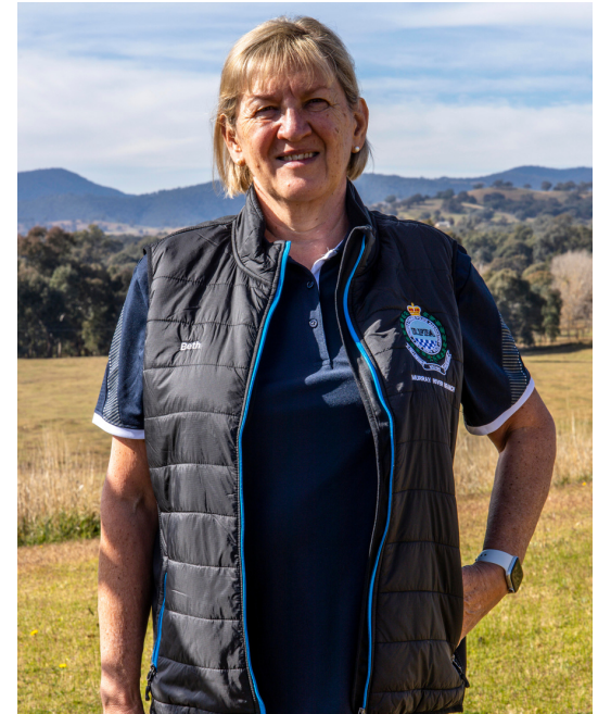
Mens & Ladies Sleath Vest (J616L & J616M) Polyester combo Front quilted, back stretch $79.95