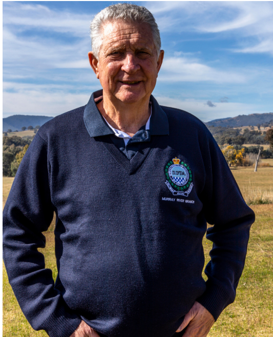
Mens & Ladies Jumper (6JMen & 6J1Ladies) 50% Wool/50% Acrylic Classic Fit $83.95